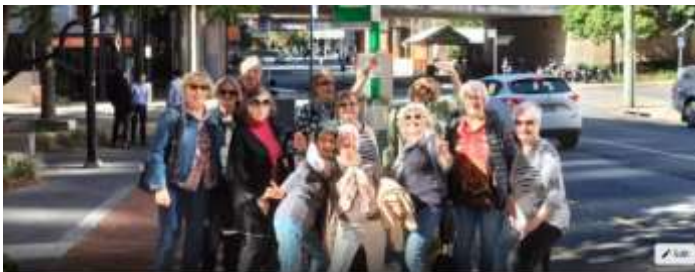
Older Women's Network (Old) Inc. Mitchelton

On the branch management side of things, our little team of volunteers has expanded. Our Facebook admin has settled into her role and the page is nothing short of exceptional with regular posts and updates sharing not only our own Branch activities but other groups' events that many of us have attended as a result.