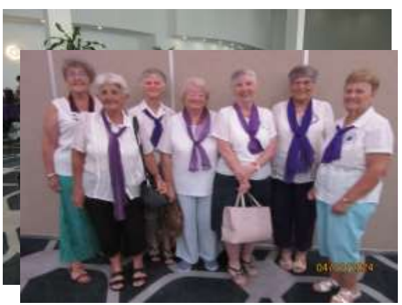
OWN groups at Maroochydore Gympie 'Girls'

We enjoyed the day, the food and the guest speakers. Thanks ladies, looking forward to your next event. We travelled back home via Buderim which was interesting as we hadn't been through there for years.